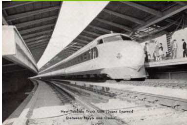
New Tokaido Trunk Line (Super Express) between Tokyo and Osaka.

One of the major reasons for taking pictures is to record life as it exists. The camera lens is like our eyes. We want to get on film what our eyes see. Our eyes can look at a newspaper, or a person across the table, or a three miles away, and they will all be sharp to us. If something very close and very far is sharp to us at the same time—like our eyes see things—it is called great "depth of field." Our eyes have a great depth of field. The lenses found on most ordinary cameras do NOT have a great depth of field. But the D. ZUIKO lens on the Olympus PEN has one of the greatest depth of fields in existence. To prove this, make a photograph of a near object, a middle object and a far-away object in the same picture. The Olympus PEN will get them ALL sharp at the same time, JUST AS OUR EYES WOULD SEE IT. [To be doubly sure, use the highest numbered f/stop whenever possible.]